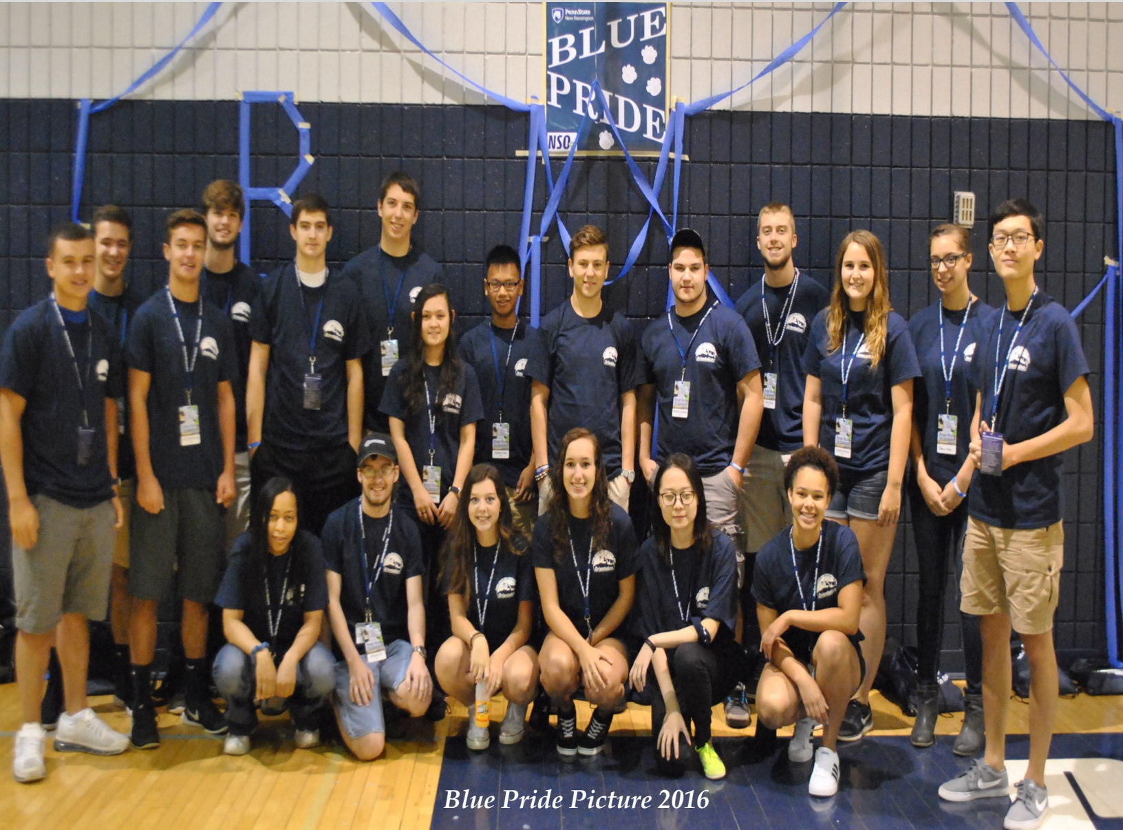
Blue Pride Picture 2016